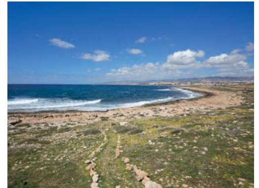
Akamas National Park

The long coastline is studded with glorious beaches and small fishing villages, and holiday resorts have been established to cater for all tastes – a few less attractive than others. There remains, though, an abundance of small, relaxed locations that continue to offer the type of warm-