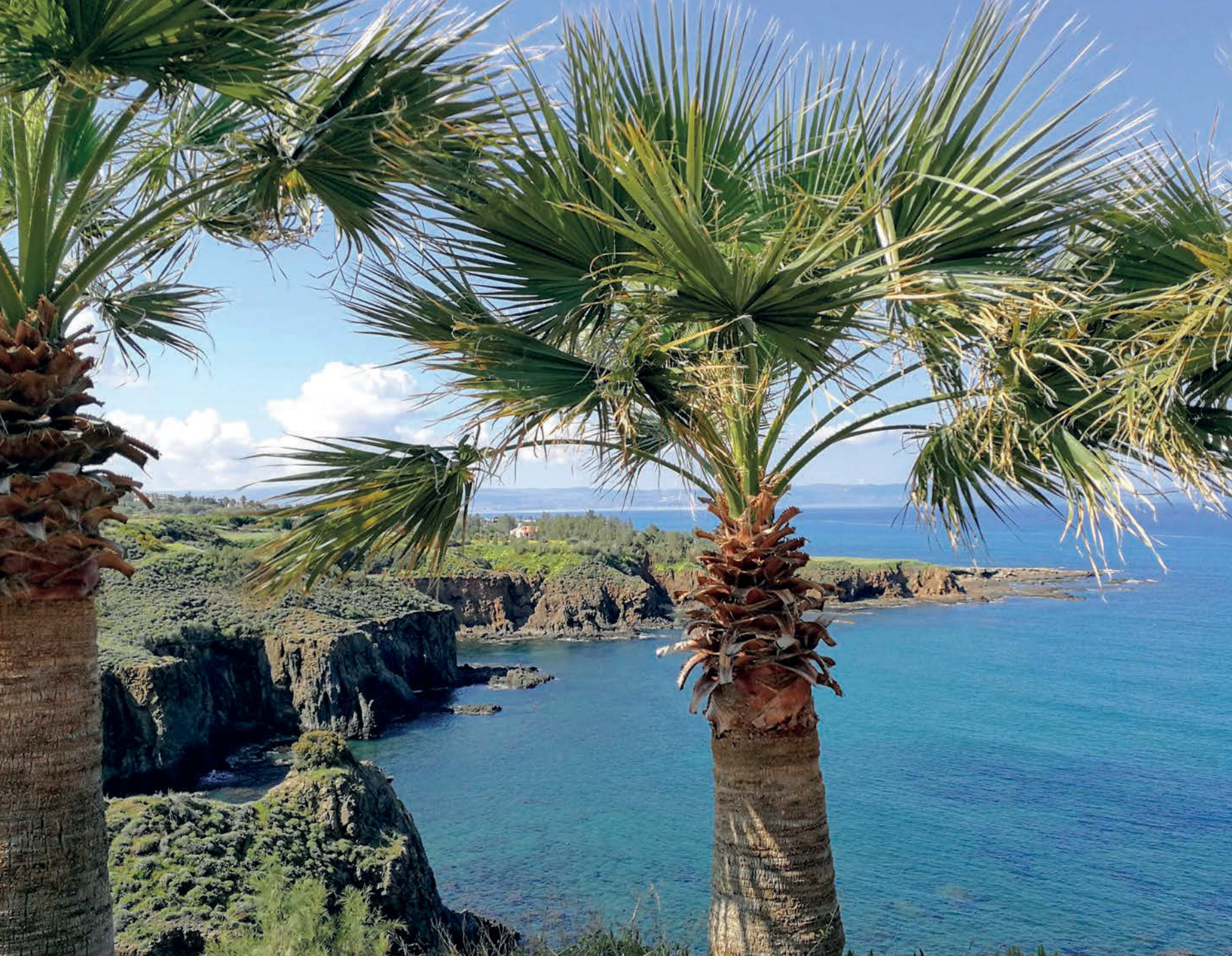
View from the gardens, Stella Maris

For more detailed information & photos visit www.gicthevillacollection.com