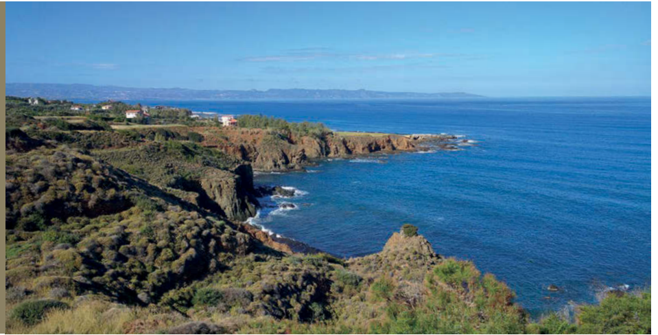
View from Stella Maris and Buffavento

Lively resorts to monastic serenity, cacophonous street life to ageless village silence